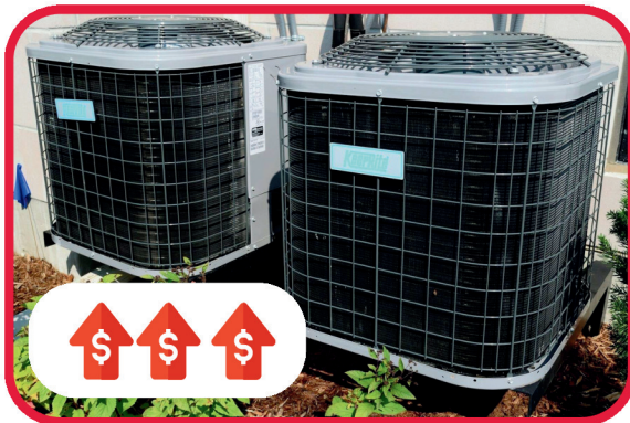
Low Efficiency High Electric Bills $

We use SEER (Seasonal Energy Efficiency Ratio) to measure how well your HVAC system works, like checking a car's MPG. If one car gets 20 MPG and another gets 10 MPG, the second one costs twice as much to drive the same distance. With SEER, a higher rating means lower electricity bills.