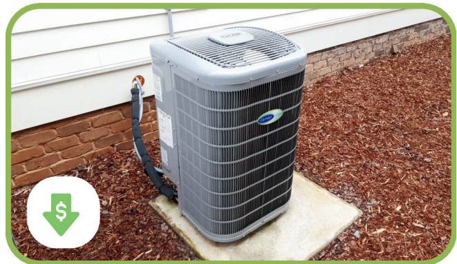
High Efficiency Low Electric Bills $